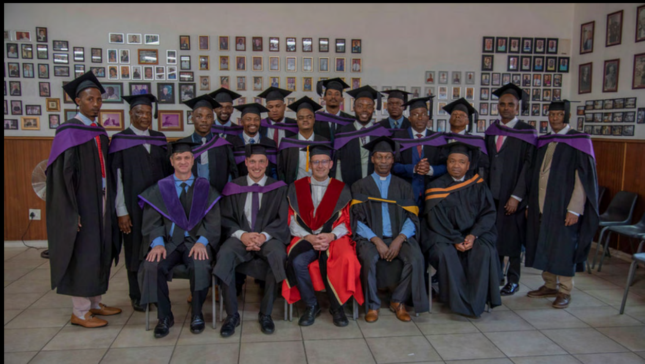
Group photo in the LTS chapel before the graduation