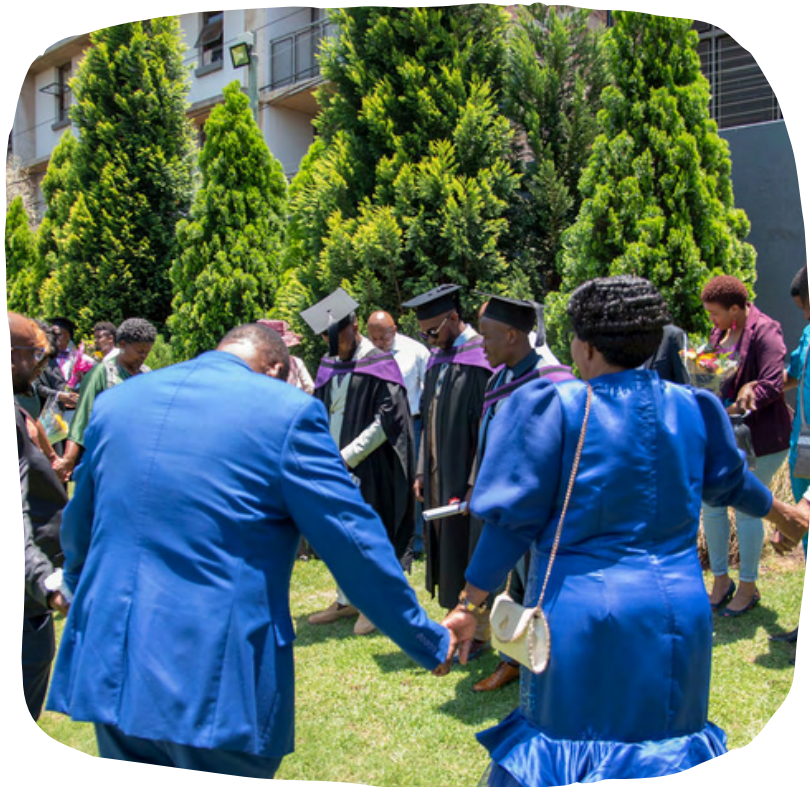
Guests and students praying after the graduation