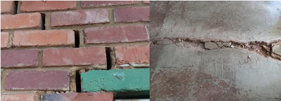
Cracks in the wall and floor

With 30 students, the LTS campus is full. Students all are sharing rooms, and there are no empty rooms left on campus. Furthermore, two of the classrooms are in bad shape. The foundation of the classrooms has a major crack, leading to cracks in the wall.